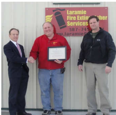
Business Of The Month, November, 2013

Need extinguisher training for your employees? Laramie Fire Extinguisher Services offers hands-on training. You and your employees will learn about different fire extinguishers and their uses. Each participant will put out a fire with an extinguisher.